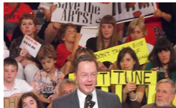
Above: Arts Council CEO Mitch Swain fires up the crowd during the Save the Arts in PA rally in Harrisburg on July 14th, 2009; Photo Credit: Chad Herzog