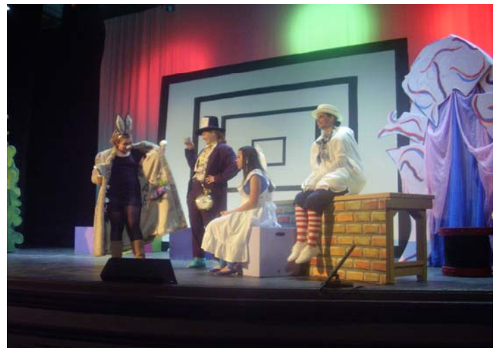
Above: Alice in Wonderland by Stage 62

Last fall, Stage 62 received a $5,000 BNY Mellon Audience Development grant facilitated by the Greater Pittsburgh Arts Council for their children's show Alice in Wonderland . This grant enabled them to purchase a new on-line ticket reservation system and a database for direct mail, which provided easier ticket purchasing. The success of these efforts can be measured by the large amount of increased attendance. In years past, similar events averaged about 300 attendees while this was attended by 1,297 people total. The result of the increase in audience members also resulted in ticket revenue surpassing budgeted expectations, and the after-show party, which had been considered a financial drain before, became profitable with sold-out attendance.