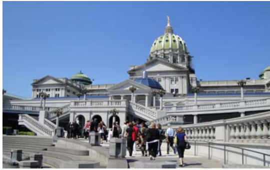
Above: PA State Capital; Photo by Tiffany Wilhelm

In addition to our involvement with Citizens for the Arts and the PCA, the Greater Pittsburgh Arts Council represents the local creative community as a member of the governing group of the Pennsylvania Cultural Data Project (PACDP). Developed as a tool to assist nonprofit cultural organizations by streamlining the grant application and reporting process for participating funders, the PACDP has proven to be a valuable tool for arts and culture researchers as well. Viewed as a national model,